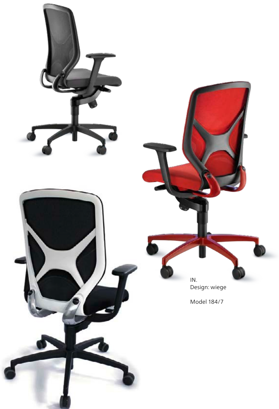
IN. Design: wiege Model 184/7

For our latest office-chair range IN, our engineers have succeeded in adapting Trimension® for the upper medium-price category. More compact, more straightforward and even more dynamic, IN offers a unique combination of natural, three dimensional sitting dynamics with superb comfort and a feeling of well-being. The synchronously flexible seat and back react to the slightest shifts in weight and follow your body in any direction, just like a second skin. But IN's not just impressive from a technical point of view. Created by wiege design company, its design is also outstanding. Distinctive pivotal points and a young athletic aesthetic make it a high-quality eye-catcher that's understated at the same time.