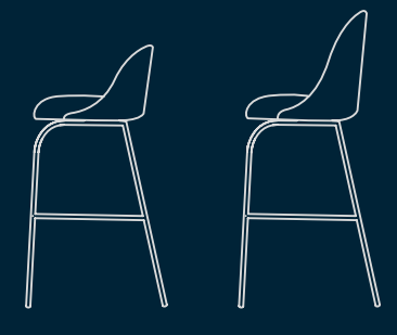
Stool high back & low back, same depth

VICCARBE reserves the exclusive right to all brands, pictures and designs used in its bid, as well as the commercial presentation of your products. Therefore, the reproduction, manufacture, distribution and / or marketing of products containing or commercial form, in any media is prohibited.