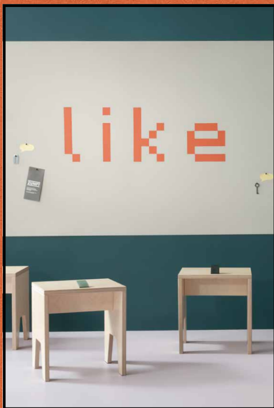
2206 | oyster shell 2211 | tangerine zest 3363 | walton lilac

BULLETIN BOARD is supplied in rolls of up to 28 metres long and 1.22 metres wide, making it suitable for large installation in for example conference rooms or alongside corridors. 3 colours are also available at 1.83m wide.