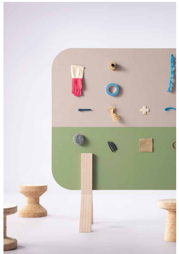
2187 | brown rice 2213 | baby lettuce 3363 | walton lilac

BULLETIN BOARD provides ideal solutions to the modern sustainable office environment where separation walls or furniture elements can double as information carriers.