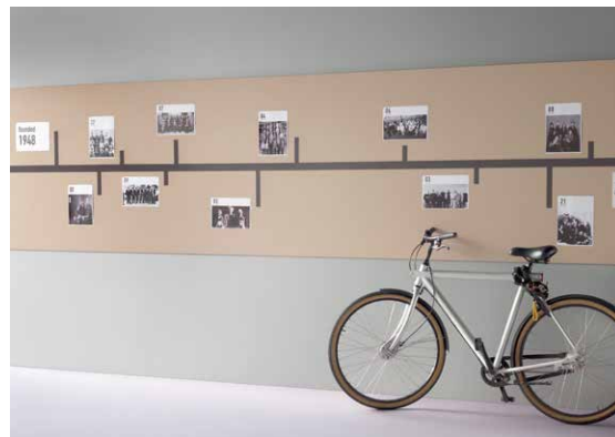
2186 | blanchet almond 3363 | walton lilac