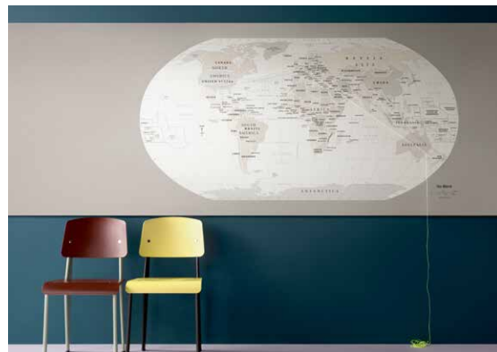
2182 | potato skin 3363 | walton lilac

BULLETIN BOARD is supplied in rolls of up to 28 metres long and 1.22 metres wide, making it suitable for large installation in for example conference rooms or alongside corridors. 3 colours are also available at 1.83m wide.