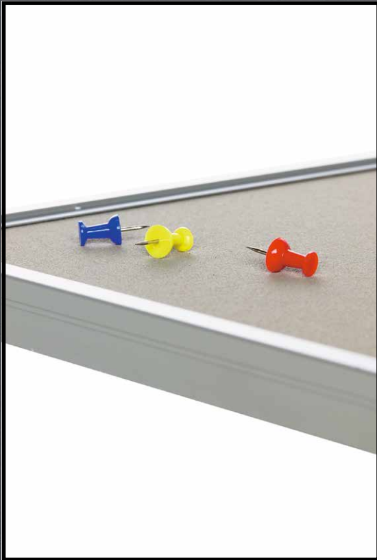
2187 | brown rice