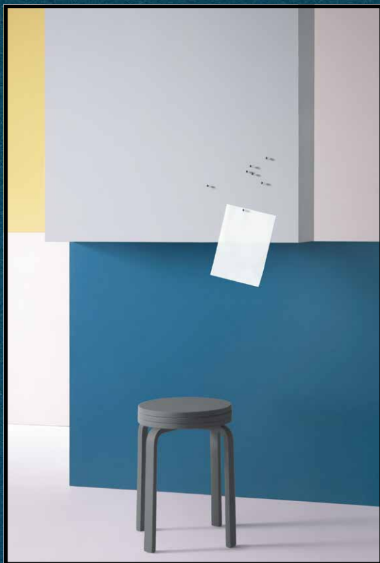
2182 | duck egg 2186 | blanchet almond 2214 | blue berry 3363 | walton lilac