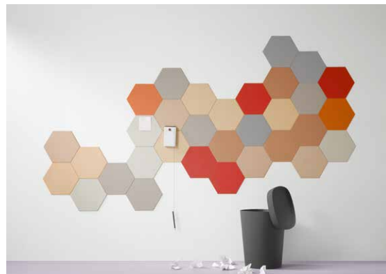
2210, 2207, 2166, 2162, 2206, 2182, 2187, 2186, 3363 | walton lilac

BULLETIN BOARD is flexible and easy to cut and handle, which allows you to create functional wall decorations with enchanting decorative effects.