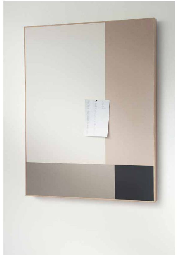
2182 | potato skin 2187 | brown rice 2206 | oyster shell 2209 | black olive

Framed bulletin board can be made in single colours that fit your needs or in decorative combinations that enhance your environment. All in various sizes and ideal to hold your thoughts or expose your creativity.