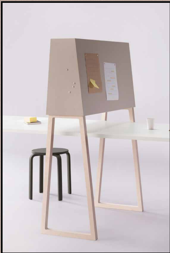
2187 | brown rice 3363 | walton lilac

Framed bulletin board can be made in single colours that fit your needs or in decorative combinations that enhance your environment. All in various sizes and ideal to hold your thoughts or expose your creativity.